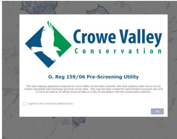
Figure 1. Legal disclaimer at application start-up.